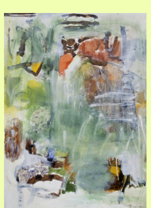
Cianne Fragionne, Untitled