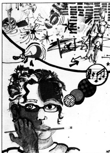
M.K. Cosier, Mixed Media 12 x 18